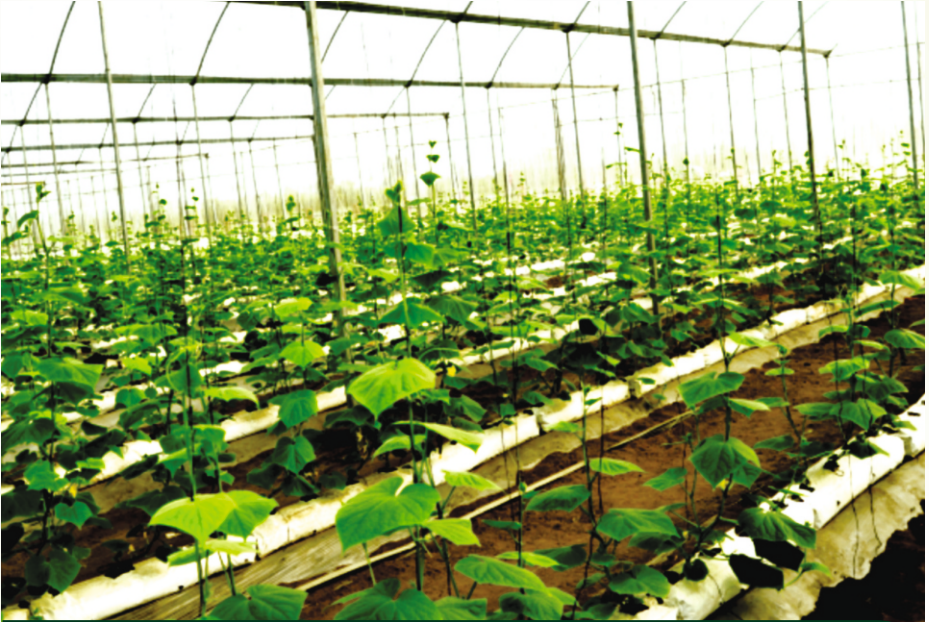
CUCUMBER PLANTATION AT GREEN HOUSE, AIRPORT ROAD

Some of our Agricultural Investments in pictures: