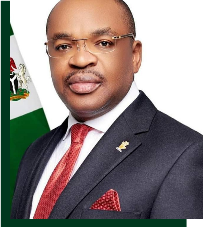
HIS EXCELLENCY, MR. UDOM EMMANUEL GOVERNOR OF AKWA IBOM STATE